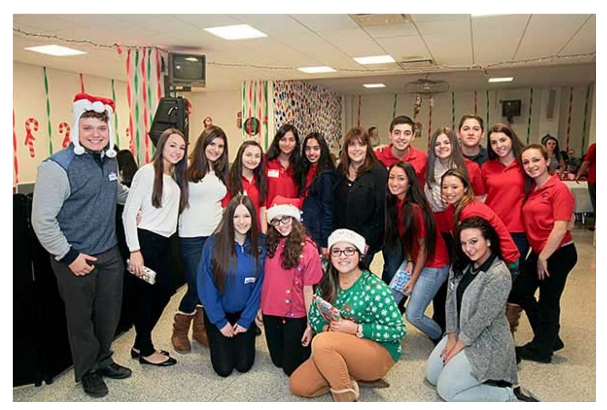
Facebook Photos here