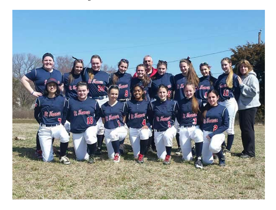
Congratulations to the Junior Varsity Softball team for winning the Archbishop Molloy Easter Tournament.

Athletics: The Girls Varsity Softball team traveled to Richmond, Virginia, for the Sports Plus Softball tournament from March 19th through March 22nd.