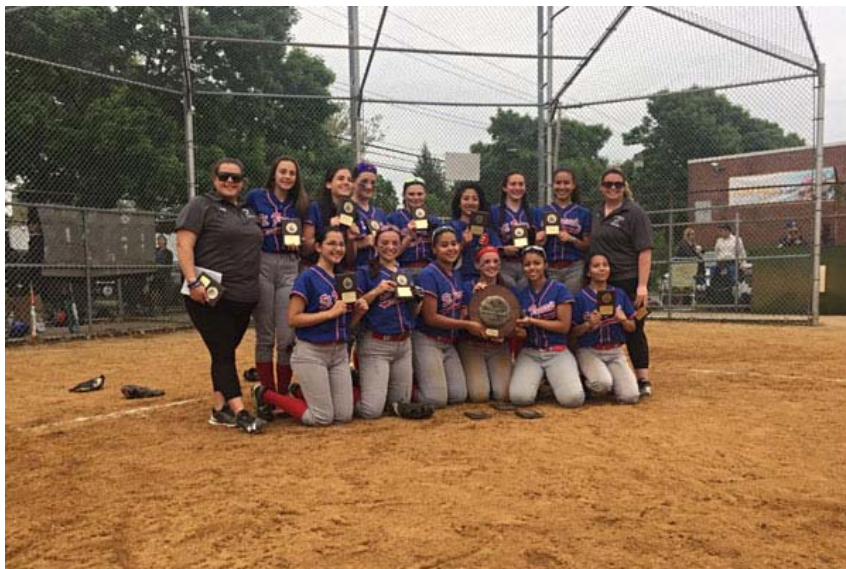
JUNIOR VARSITY SOFTBALL - 2017 CHSSA BROOKLYN-QUEENS CHAMPS!