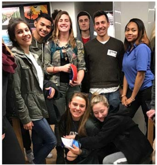
Nassau Community College Art Competition