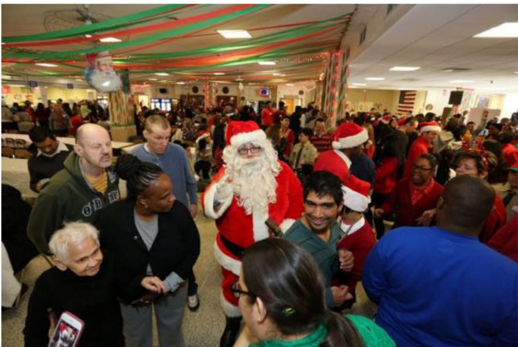
Article in the Tablet