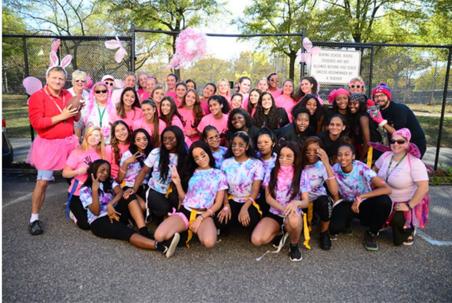
Annual Powder Puff Games

SFP seniors participated in our Annual Powder Puff Games to raise awareness of Breast Cancer. Photos here: https://flic.kr/s/aHsmHUnsUW