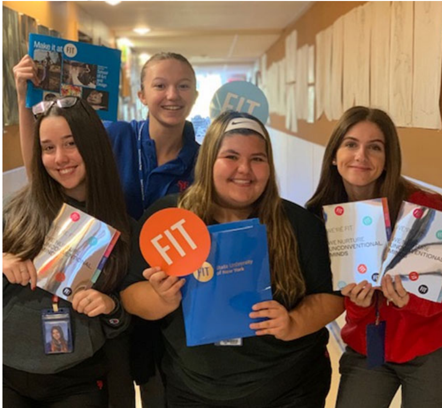
Portfolio Day SFP