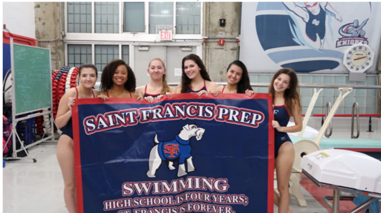
Girls Varsity Swimming Senior Day