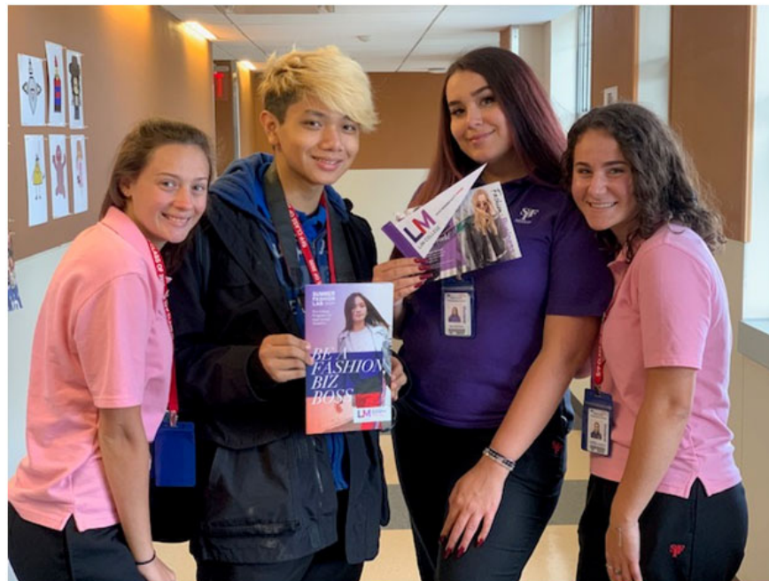
Portfolio Day SFP

The Saint Francis Prep Art department hosted admission counselors from 16 art schools, including SCAD, Lesley University, PRATT, School of Visual Arts, Parsons, and the Fashion Institute of Technology. Art students had the opportunity to speak to the counselors and receive portfolio feedback. Students had their art work critiqued and received one-to-one portfolio reviews. The art college representatives were impressed with the student art work and offered invaluable advice. A fabulous afternoon was had by all who attended!