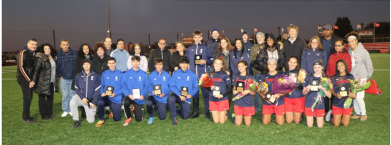
Soccer Senior Night