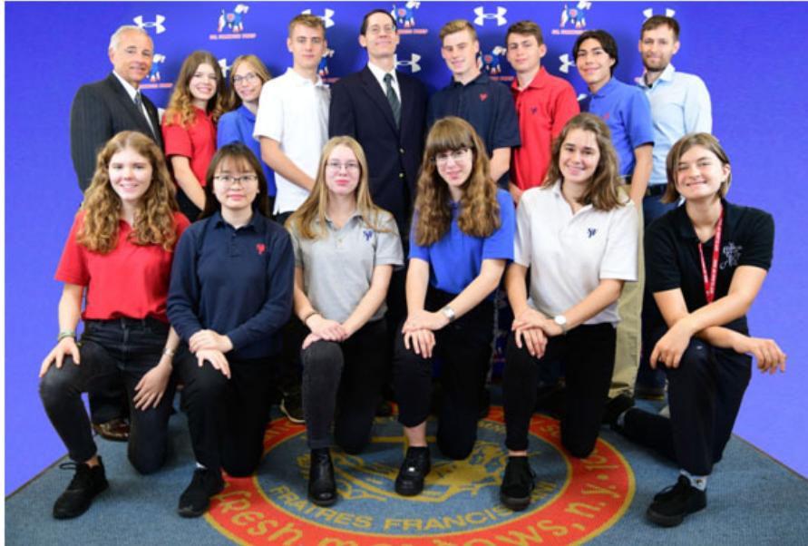
German Exchange Students