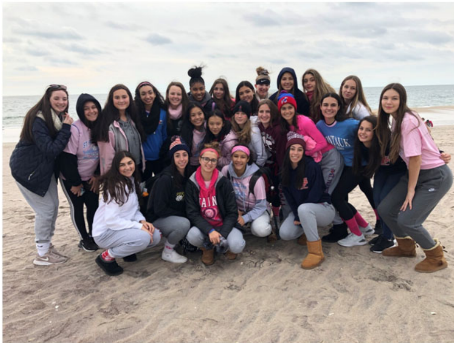
Breast Cancer Walk in Jones Beach

The girls JV and Varsity Volleyball team walked at the Breast Cancer Walk in Jones Beach on October 20. They also raised over $400 for the cause.