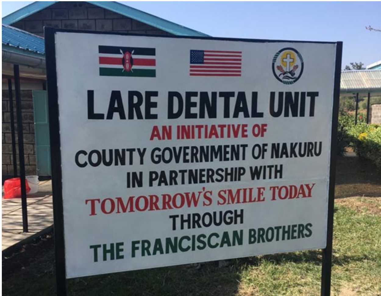
Lare Dental Clinic, Kenya