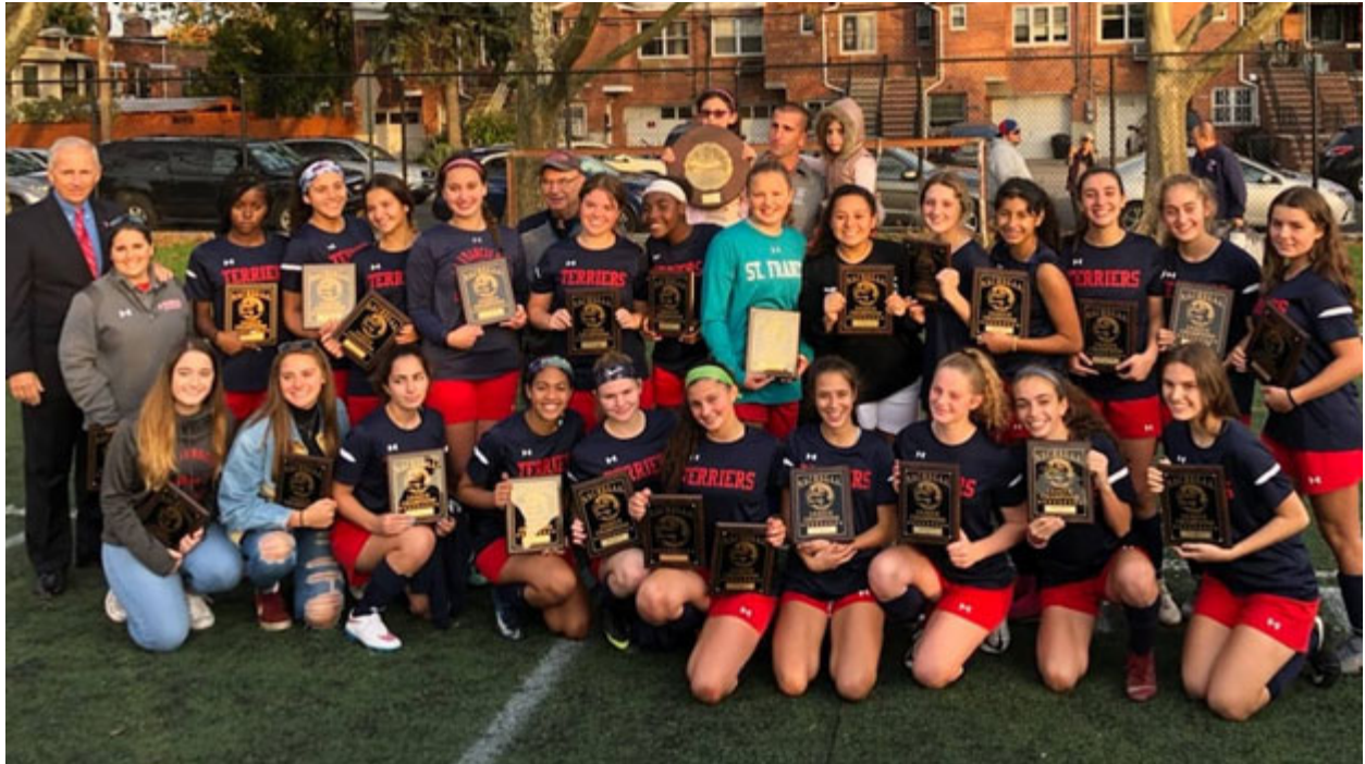
Nassau Suffolk CHSGAA Champions