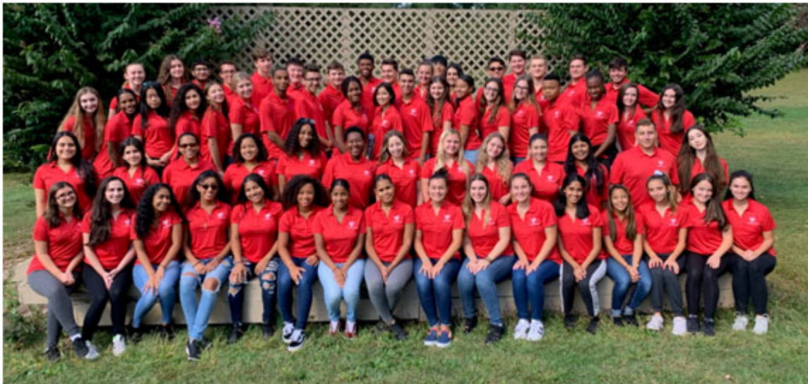
The SFP Campus Ministry team

On October 3rd and 4th, 65 juniors and seniors travelled out to Camp Alvernia with the SFP Campus Ministry team and some of the sophomore Religion teachers to prepare for their year of service as sophomore retreat leaders. The group was split into eleven smaller teams and participated in team-building activities and training. The goal of the overnight training was not only to give the leaders their own retreat experience but also to equip them with the tools needed to effectively lead the sophomores on their retreats throughout the year. Our retreat leaders are excited to work and pray with sophomore class this year and are ready to help them foster good relationships and think about their values.