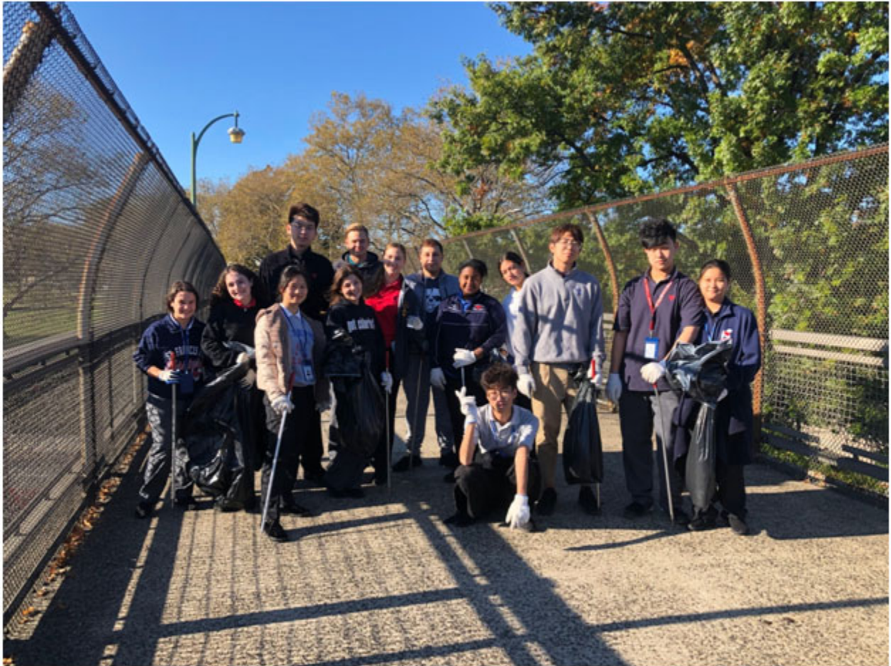
Cunningham Park Clean Up Service