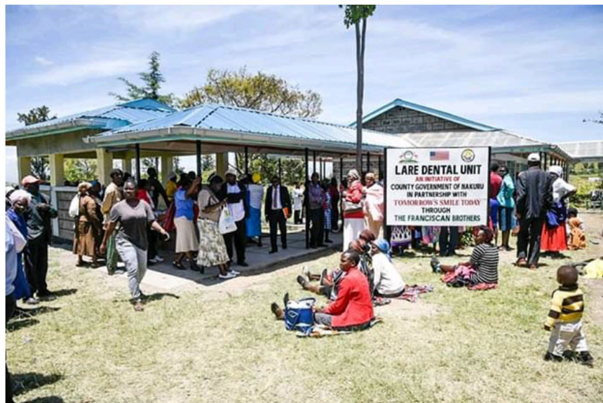
Lare Dental Clinic, Kenya