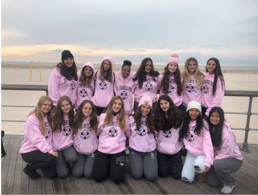
Making Strides Against Breast Cancer Walk

On October 20th, the JV Girls Soccer team participated in the Making Strides Against Breast Cancer Walk at Jones Beach. It was a great team turnout. Together they raised $1,264 for The American Cancer Society.