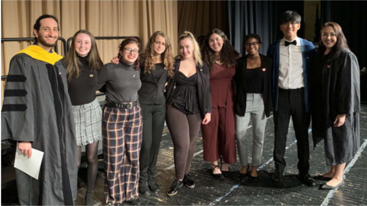
Our Executive Board