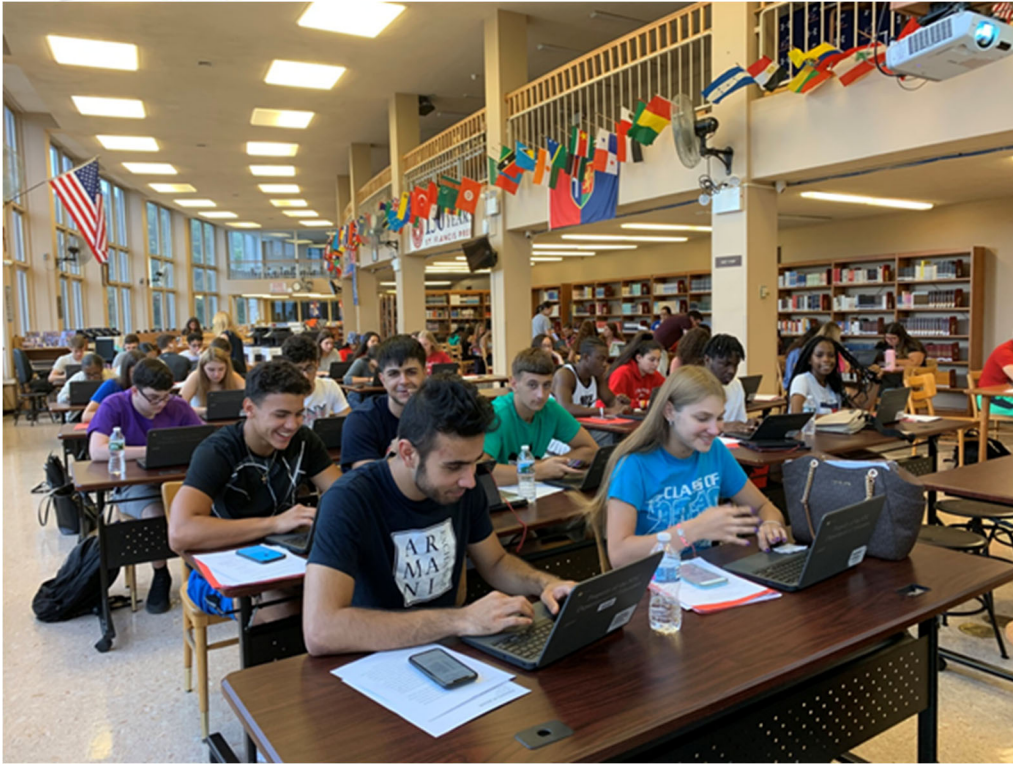
Common Cents Program